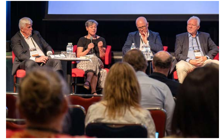
The 2024 Forestry Australia Symposium has a filled program including a panel session along with field trips with early bird offers closing soon.

This field trip will be hosted by DJAARA, The Dja Dja Wurrung Clans Aboriginal Corporation to introduce participants to Galkgalk Dhelkunya ("to care