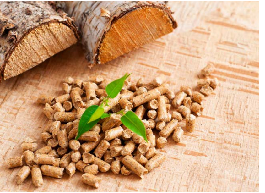
The now approved mill will generate an estimated $64.1m for the local economy.

The plant is proposed for land along Hutchinson Road, adjacent to Mount Gambier Regional Airport with the plant to attract a number of b-double trucks during