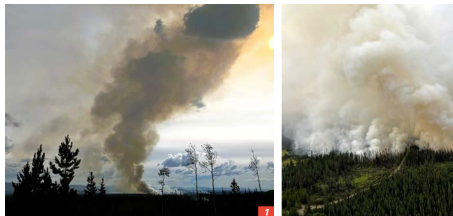
1/ Forest fires are once again running rampant in parts of Canada. 2/ The Australian crews have a vast experience in battling bush fires here and will provide valued skills.

The NSW contingent is coordinated by the NSW Rural Fire Service and made up of 20 RFS representatives, five from National Parks and Wildlife, two from State Emergency Services and four