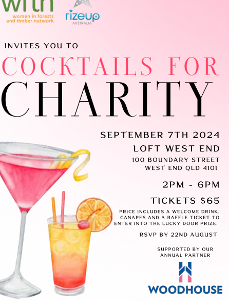
An invitation goes out to everyone... "participation and donations will make a significant difference in the live of those rebuilding after domestic and family violence."

"Your participation and donations will make a