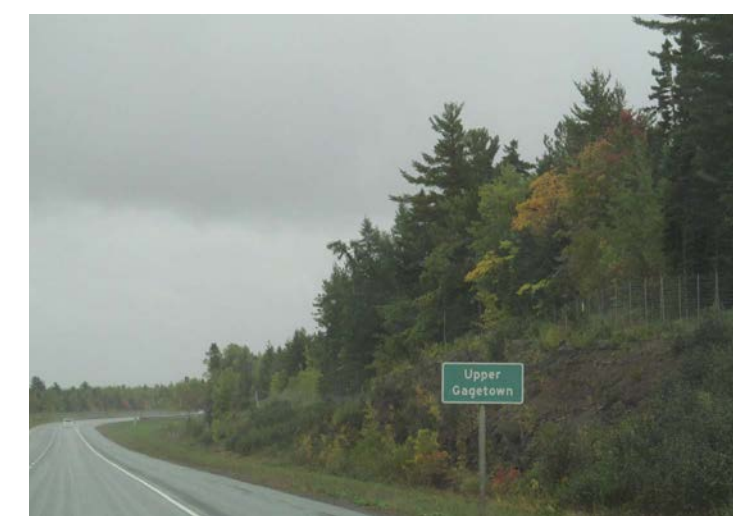
More than $71 million has been provided to plant two billion trees in two years.

Additionally, a $295,000 contribution to the New Brunswick Environmental Network (NBEN) has been