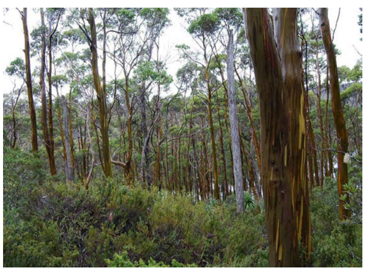
Tasmanians can now have their say on the Regional Forestry Agreement Image: Natalie Tapson, Eucalyptus subcrenulata

Established in 1997, the RFA is a joint initiative funded