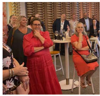
Last year's event raised an impressive $20,000 for BDVS.

significant difference in the lives of those rebuilding after domestic and family violence."